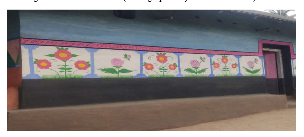
Fig. 7: Floral motif