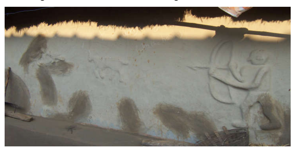
Fig. 3 (fresco): hunting scene

Revisiting the Adivasi Aesthetic of the Jungle Mahals, Eastern India