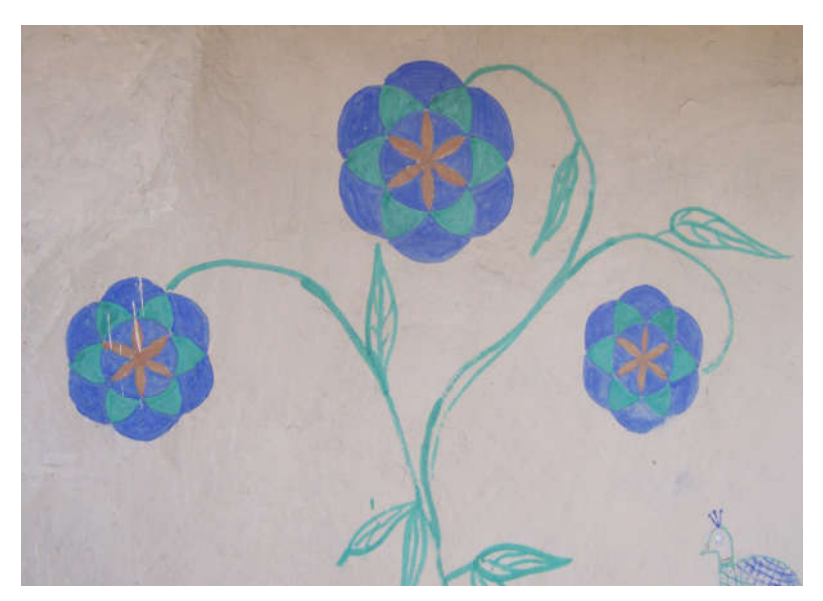
Fig.4: jarā pat (star shape), (Photographed by N. K. Mahato)

transmitting ideas. She does not consider all the figures as the same size. In a finger-drawn painting how lily flowers and birds are shown in a water body (Fig. 5). There was a significant shift that occurred in recent times in mural paintings when they used to apply chemical colours purchased from the markets. They are less interested in frescos with mud soil base applying natural colours but used to draw colourful paintings with geometrical design (Fig. 6), floral motifs (Fig. 7) and human figures.