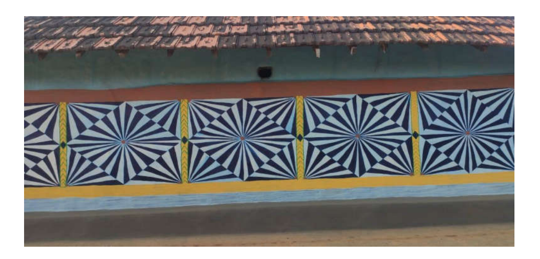
Fig. 6: Geometrical motif