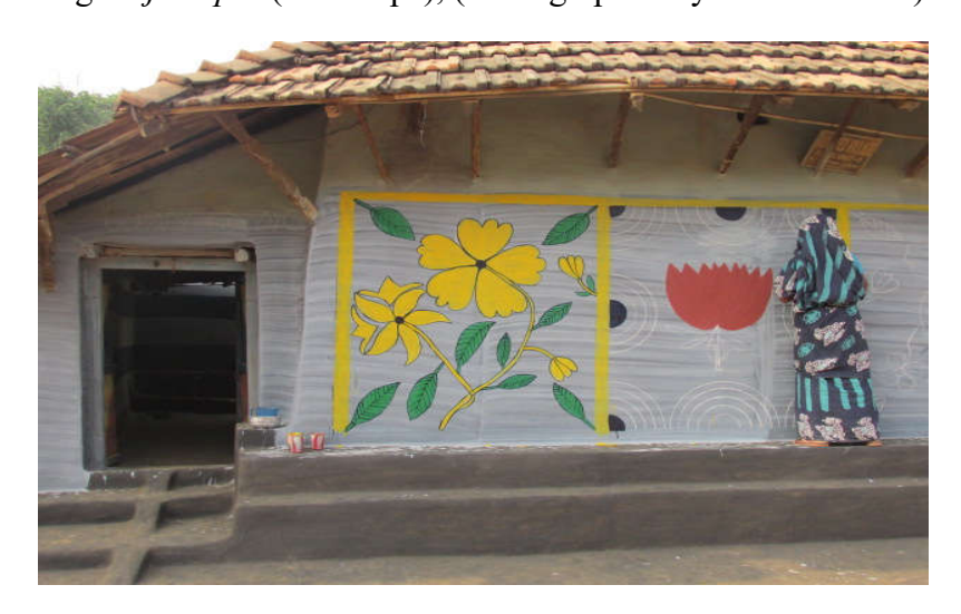
Fig. 5: An woman artist drawing susni plant (painting), (Photographed by N. K. Mahato)