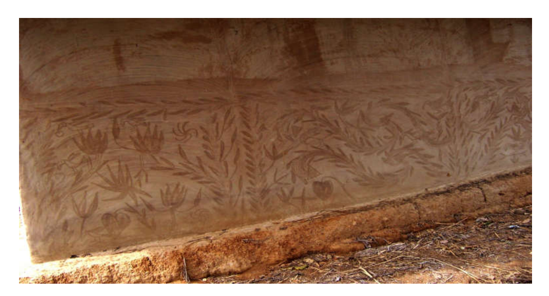
Fig. 5: lily flowers and birds