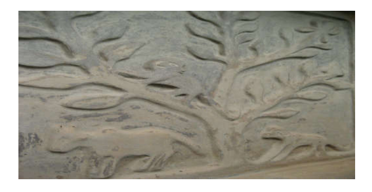
Fig. 2(fresco): Growing Plant