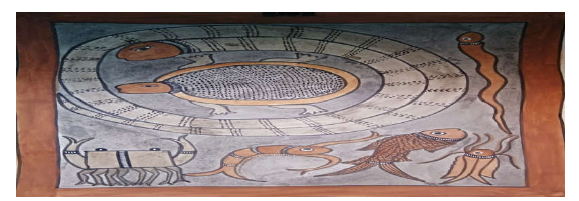
Fig 9: Earthworm depicted in Scroll painting, Artist Anil Chitrakar, Susunia

In the creation myth of the Adivasis, the earthworm acquired an important place (Fig 9).<sup>3</sup> When the earth was full of water the Almighty God (Thakur jew) appealed to different water faunas such as crocodiles, and prawns to make the earth in the formation of land. Among them, only the earthworm was successful to perform this great job with the help of the tortoise. Thus both the earth and the earthworm acquired a significant place. It possessed immense power. According to their worldview, all the earth's soil was produced by earthworms. It has been reflected in the Adivasi scroll painting. The earth produced by the earthworms was very popular among the Adivasis as they used it for cleaning their hair. They also used it for the decoration of their houses. The medicinal properties of earthworms are recognized in different parts of the world. These are used in curing different diseases such as asthma, hypertension, epilepsy, and snake and spider bite. According to their worldview, the human is not considered above the earthworm as it provided for the habitation of human beings, faunas, and floras. Thus, the Adivasi worldview is contrary to the European worldview where human is placed above animals. It illustrates the entangled relationship between animals and human beings.