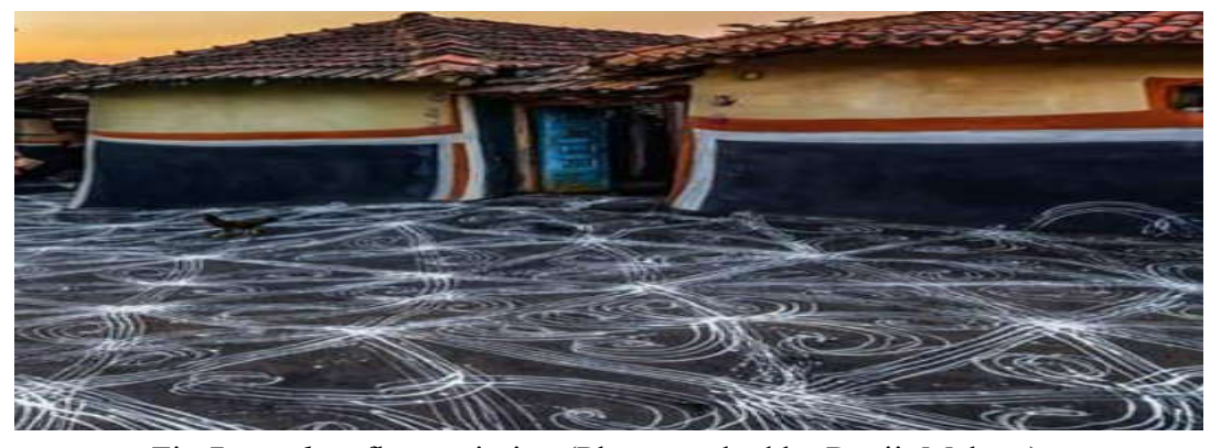
Fig 7: cawk or floor painting