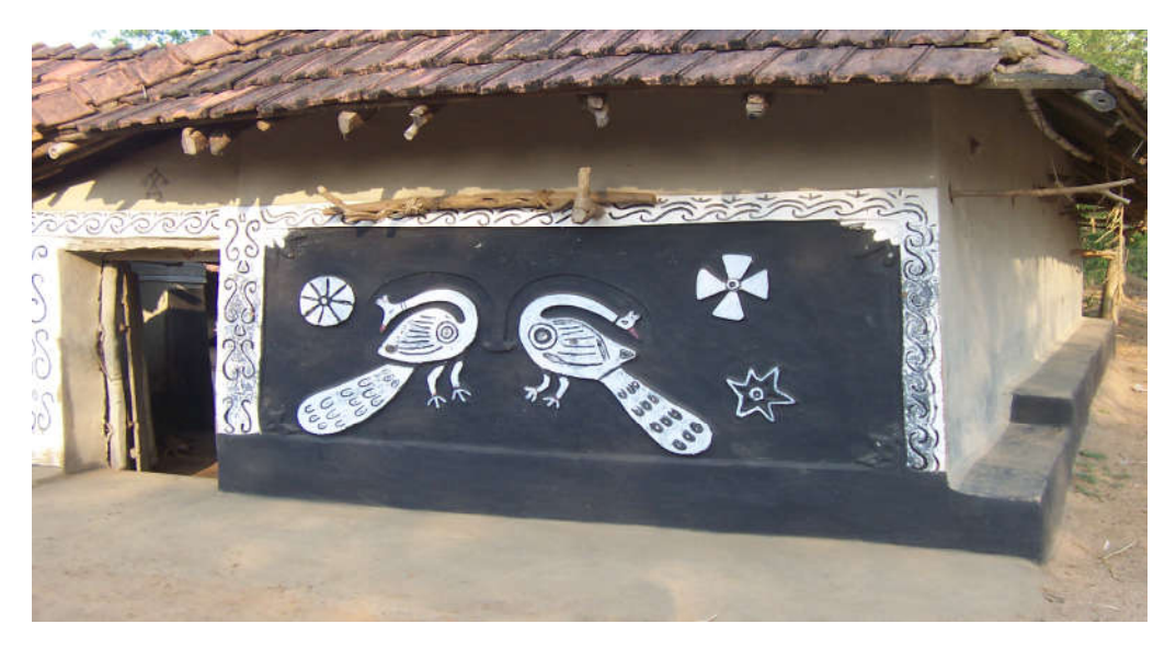
Fig 1(fresco): Peacock with susni leaf

formulated her enormous events and energy after listening to the description (Mahato 2020: 53). Some birds and flowers like gagar sālo, panir-pio, maino-miru , and lotus flowers symbolise bride. This aesthetic tradition induced fertility for them in and afterlife.